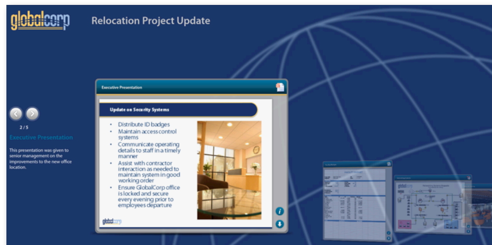
Example of a PDF Portfolio

Tip: To combine files into a single PDF file, see Merge multiple files into one PDF file with Adobe Acrobat XI .